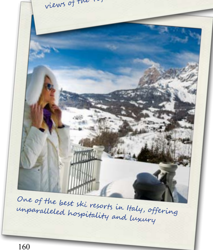
One of the best ski resorts in Italy, offering unparalleled hospitality and luxury